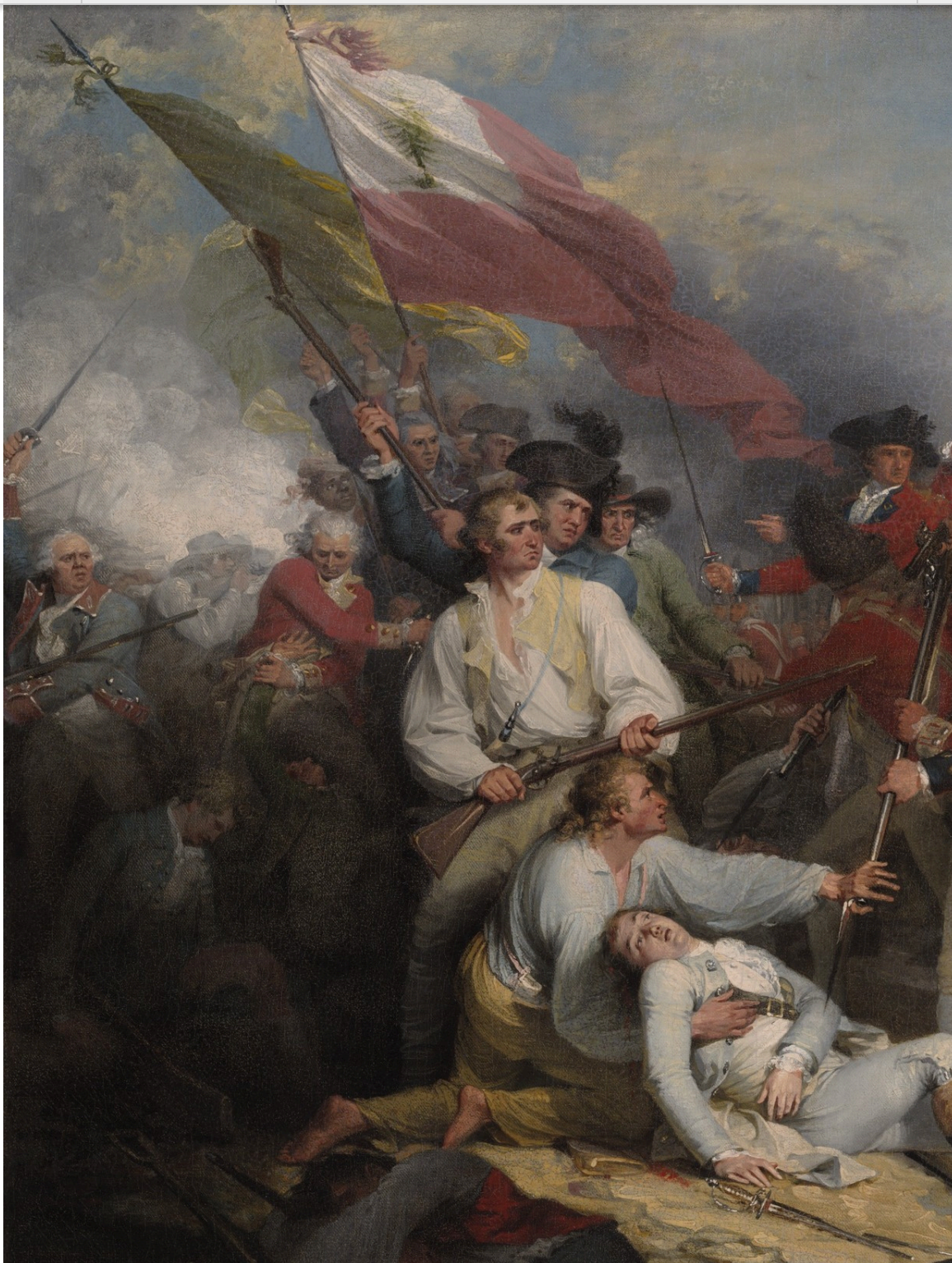
Detail from John Trumbull's "The Death of General Warren at the Battle of Bunker's Hill, June 17, 1775."

The central figure defending the fallen General Warren is Colonel Thomas Knowlton from Ashford, Connecticut.