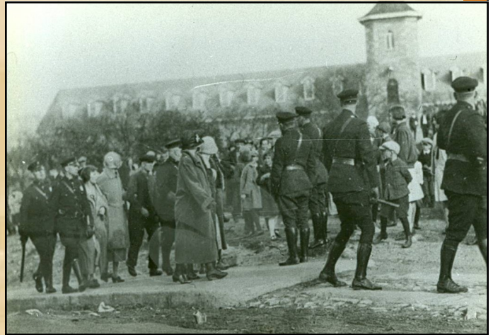
Connecticut state police escorting strikebreakers to work during the 1925 American Thread Strike in Willimantic, CT.

involved in violence. Flynn has been described as "an East Side Joan of Arc." For more information, call 860-456-2178 . The program is funded in part by a grant from Connecticut Humanities.