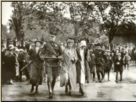
1925 American Thread Strike.

The 1912 strikes in Willimantic began about a month after the famous and successful Bread and Roses