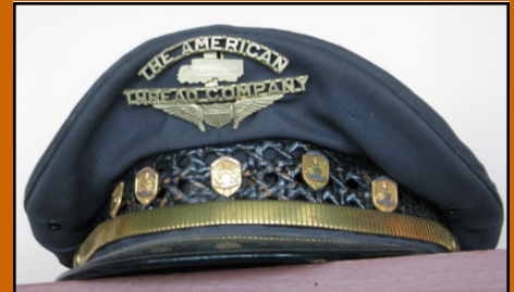
Top: Nineteenth-century women's hat. Mary Harris "Mother" Jones, the famous labor organizer of the late 1800s and early 1900s, wore a hat like this. Harriet Hanson Robinson, a mill worker in Lowell, MA, in the 1800s, reported that women who left rural New England communities to take jobs in the textile factories quickly traded in their old-fashioned bonnets for stylish "city hats" like this. Middle: Truck driver's hat from the American Thread Company in Willimantic, CT. Left: A nurse's hat and cape. Below: Mill worker attire from the 1940s at the American Thread Company.